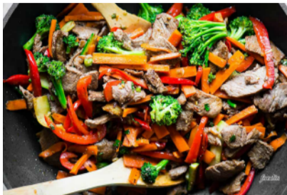
Beef & Vegetable Stir Fry