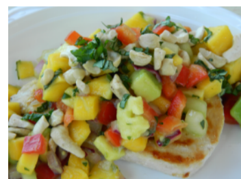
Mango Salsa Chicken