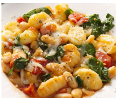
Gnocchi, white beans & Spinach