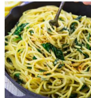
Lemon garlic spinach pasta