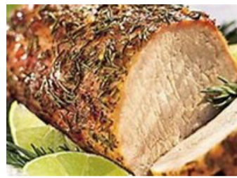
Rosemary Garlic Pork Loin