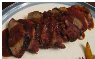
BBQ Pork Loin