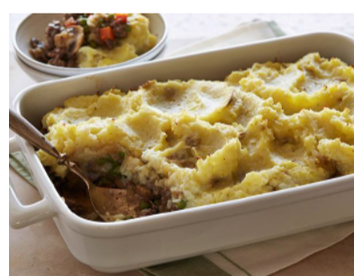
Lentil Shepard's Pie